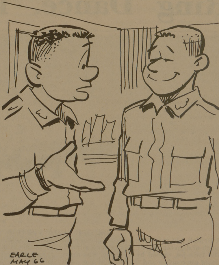
EARLE MAY 66

Follow the path, now. Original thought might take effort.