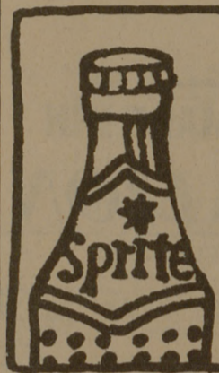
SPRITE. SO TART AND TINGLING. WE JUST COULDN'T KEEP IT QUIET.

What did you do when Joe (Boxcar) Brkczpluj was kicked off the football team just because he flunked six out of four of his majors? What did you do, Wallace Middendorp?