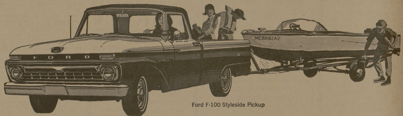
Ford F-100 Styleside Pickup