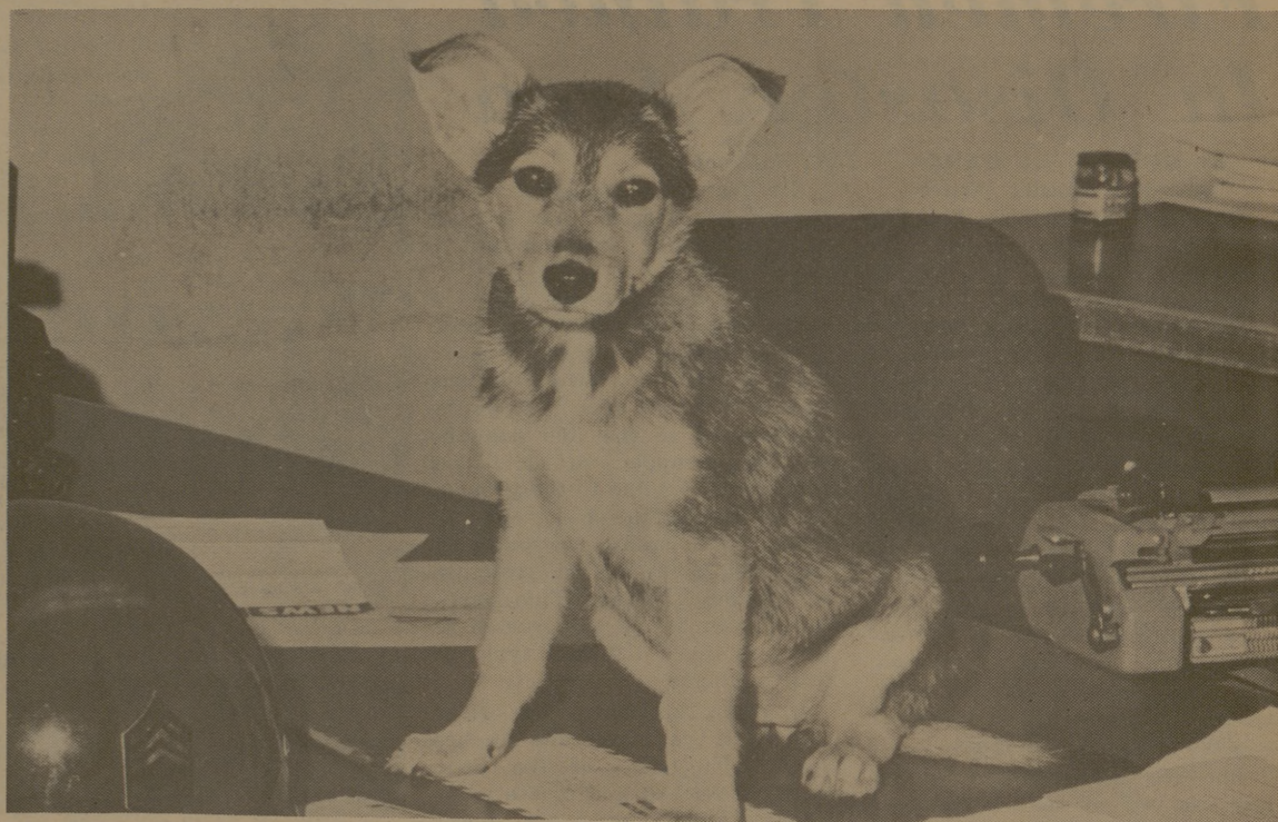
SPLASH DAY REFUGEE

CORRECTION Piggly Wiggly Thursday, May 5, Ad Should Have Read BABY BEEF ROUND Steak ..... 79c Lb. Not ..... 69c Lb.