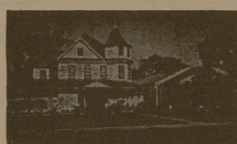
Hillier Funeral Home

BRYAN, TEXAS 502 West 26th St. PHONE TA 2-1572