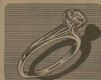
FUTURA $150 TO 1975