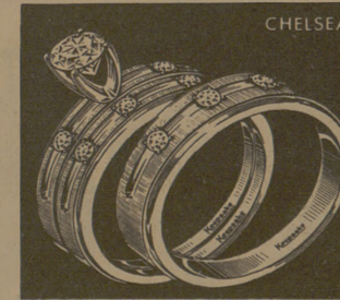
PRICES FROM $100. TO $5000. RINGS ENLARGED TO SHOW BEAUTY OF DETAIL. TRADE-MARK REG. A. H. FORD COMPANY, INC., ESTABLISHED 1922

And, for good reasons... like smart styling to enhance the center diamond... guaranteed perfect (or replacement assured)... a brilliant gem of fine color and precise modern cut. The name, Keepsake, in your ring assures lifetime satisfaction. Select your very personal Keepsake at your Keepsake Jeweler's store. Find him in the yellow pages under "Jewelers."