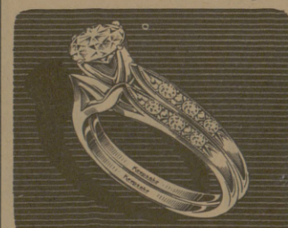
CELEBRITY I $350 TO 2100 WEDDING RING 75.00

Rings enlarged to show detail. Trade-Mark Reg.