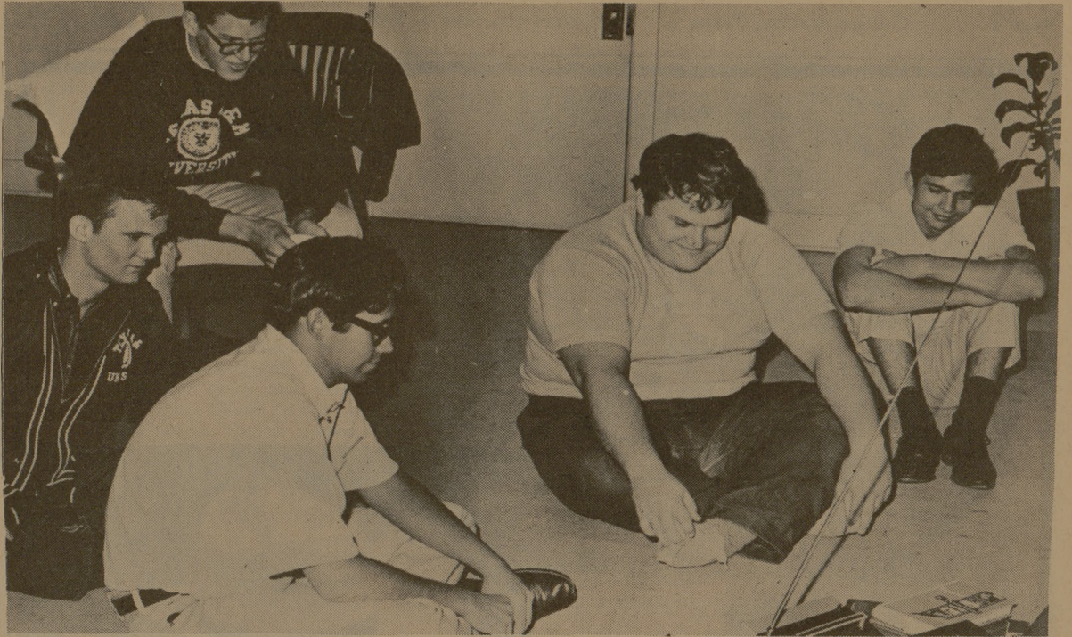
JUST PASSING TIME

The A&M Research Foundation will administer the research.