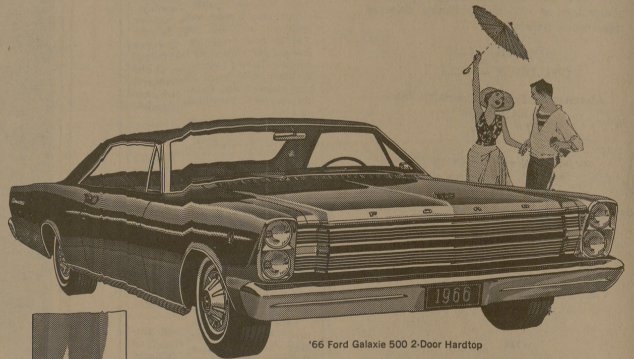
'66 Ford Galaxie 500 2-Door Hardtop