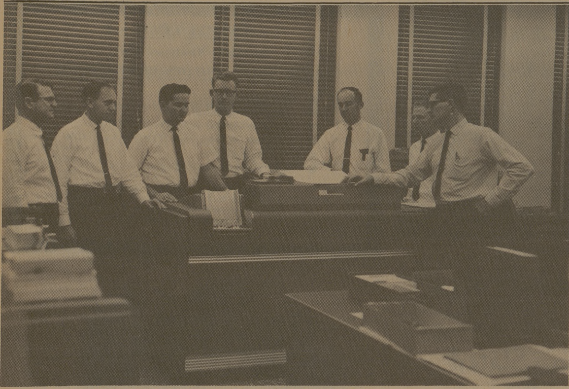
AGGIE STATISTICIANS IN AUSTIN