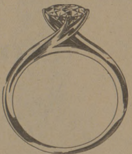
SONATA $125 TO 1975

FLAWLESS DIAMONDS GUARANTEED BY Keepsake