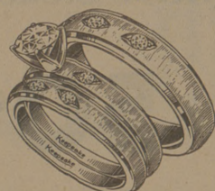
CAROLINE $200 TO 350 WEDDING RING $2.50 MAN'S RING 100

Rings enlarged to show detail. Trade-Mark Reg.