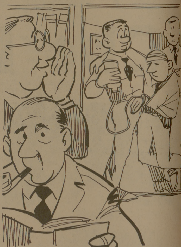
"Don't look now, but I believe you're fixing to get one of th' most creative excuses for leaving early for th' holidays you've ever seen!"

Seniors and graduate students who will graduate at the end of the current academic year are urged to register with the Placement Office. The earlier one registers, the sooner a reference file can be built.