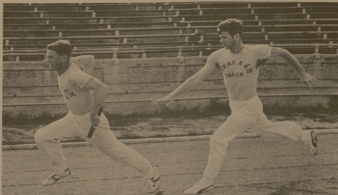
... two members of the crack 440 relay team work on handoff in preparation for the Texas Relays.