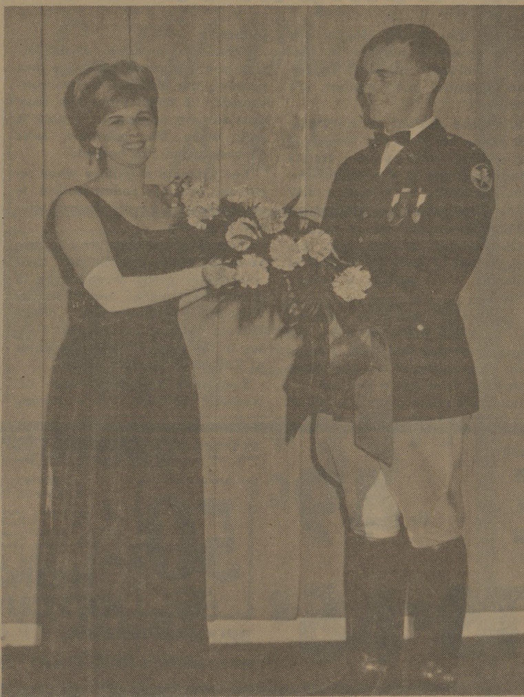
NEW BAND SWEETHEART