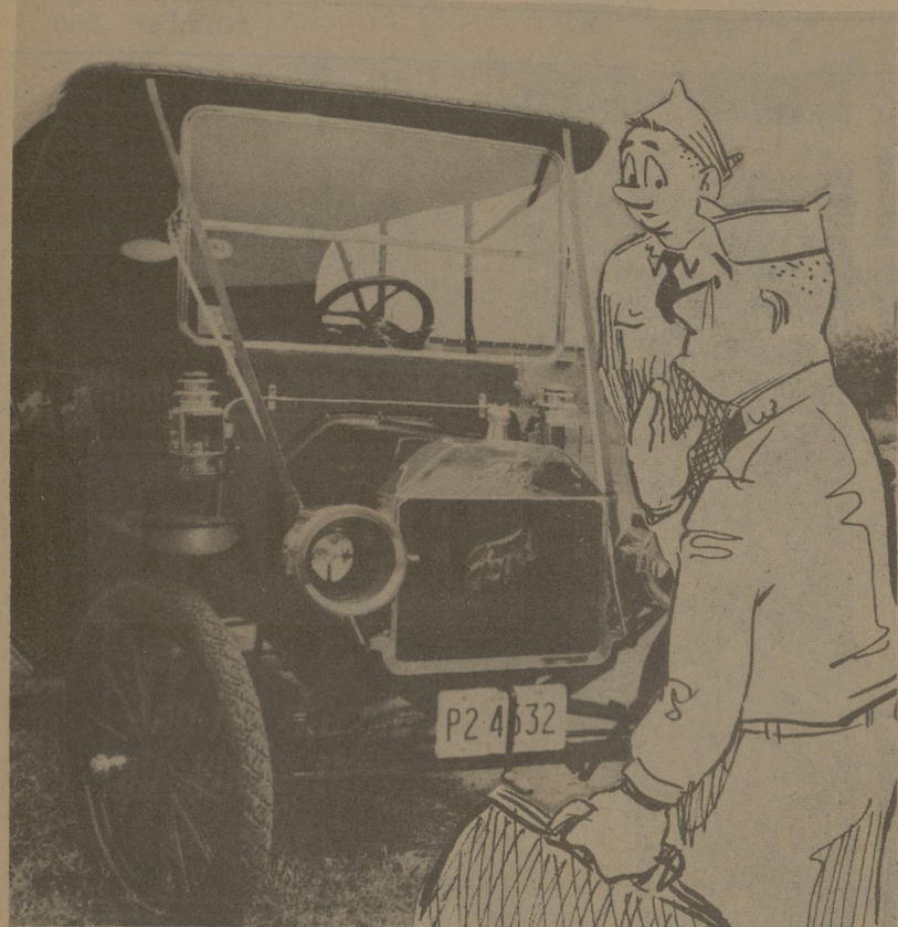
"I think you'll be glad to know that we'll be driving at a safe speed on th' way home!"