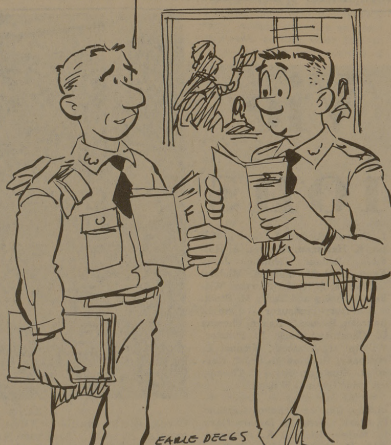
"This is intellectual starvation! Here I am—concerned with Viet Nam, SCONA beginning, the Aggie Players presenting plays and many other experiences—and he wants us to waste our time worryin' about quizzes!"