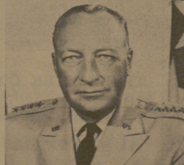
GEN. PAUL D. HARKINS Post U. S. Commander In South Viet Nam