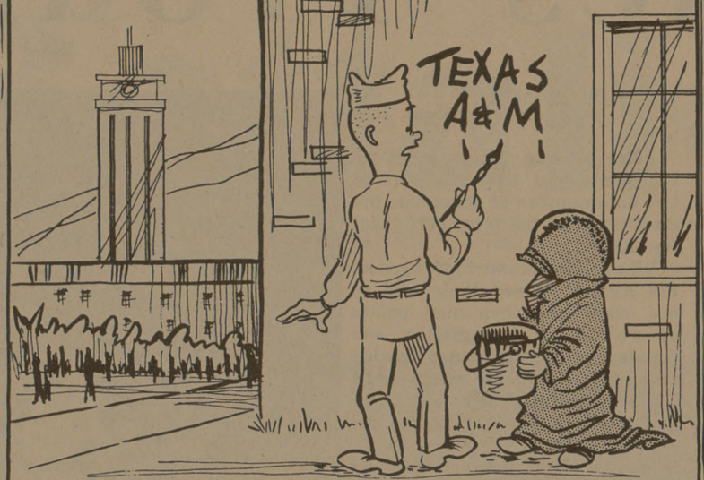
"It's embarrassing to not know whether to say 'college' or 'university' or even A&M!"