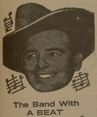
The Band With A BEAT

Mink Art Supply Picture Frames 923 So. College Ave - Bryan, Texas