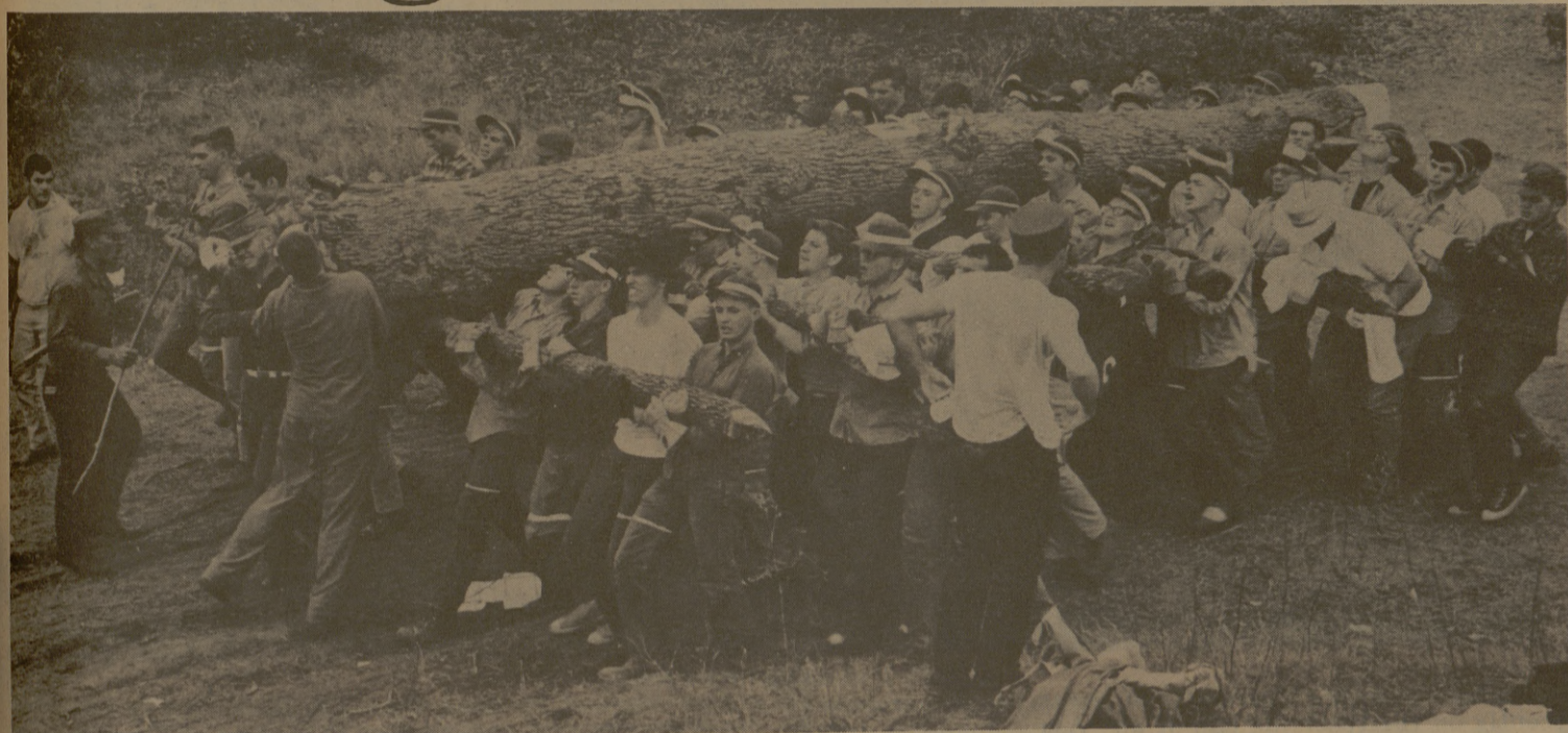
FRESHMEN SHOW STRAIN OF CARRYING LOG OUT OF CUTTING AREA ... big log takes a lot of man power to be carried out, but freshmen display their energy.