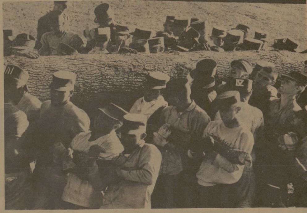
UP IT GOES ... second step in carrying logs is demonstrated by freshmen.