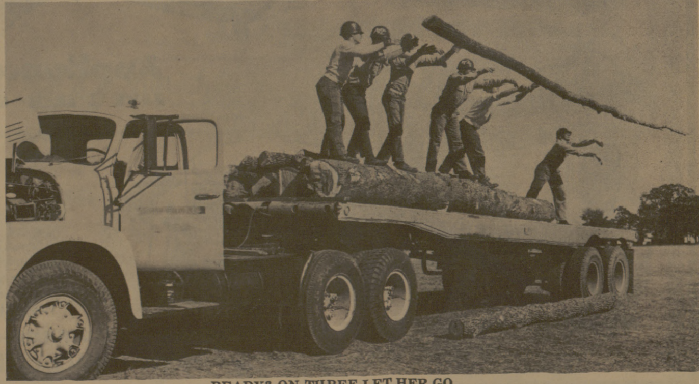
READY? ON THREE LET HER GO ... logs are unloaded at stacking area behind Duncan Dining Hall.