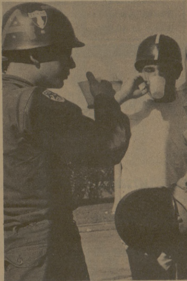
AGS TAKE BREAK ... water tastes mighty good after hard work.