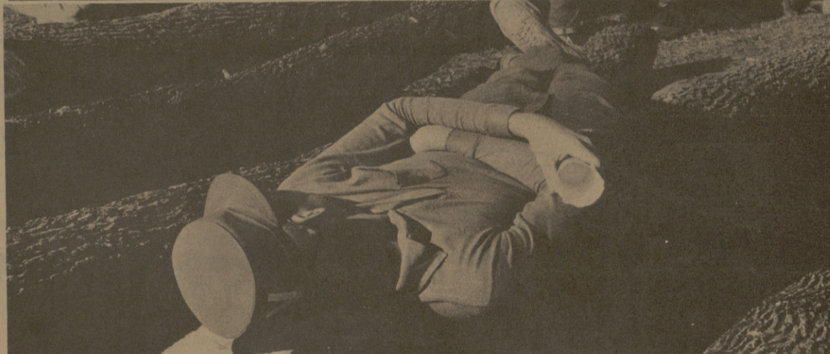
RESTING AFTER A LONG, HARD DAY ... fish takes breather and water break after hauling logs from cutting area.