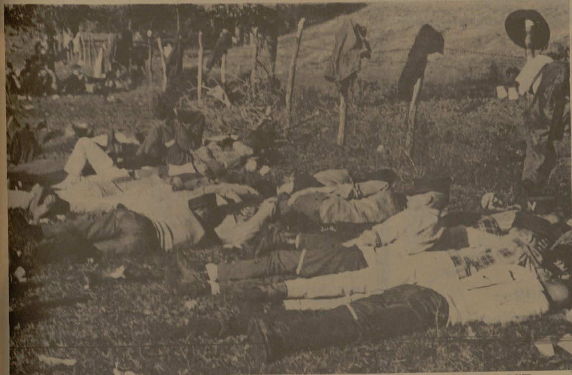
REST AT LAST ... outfit takes break at cutting area.