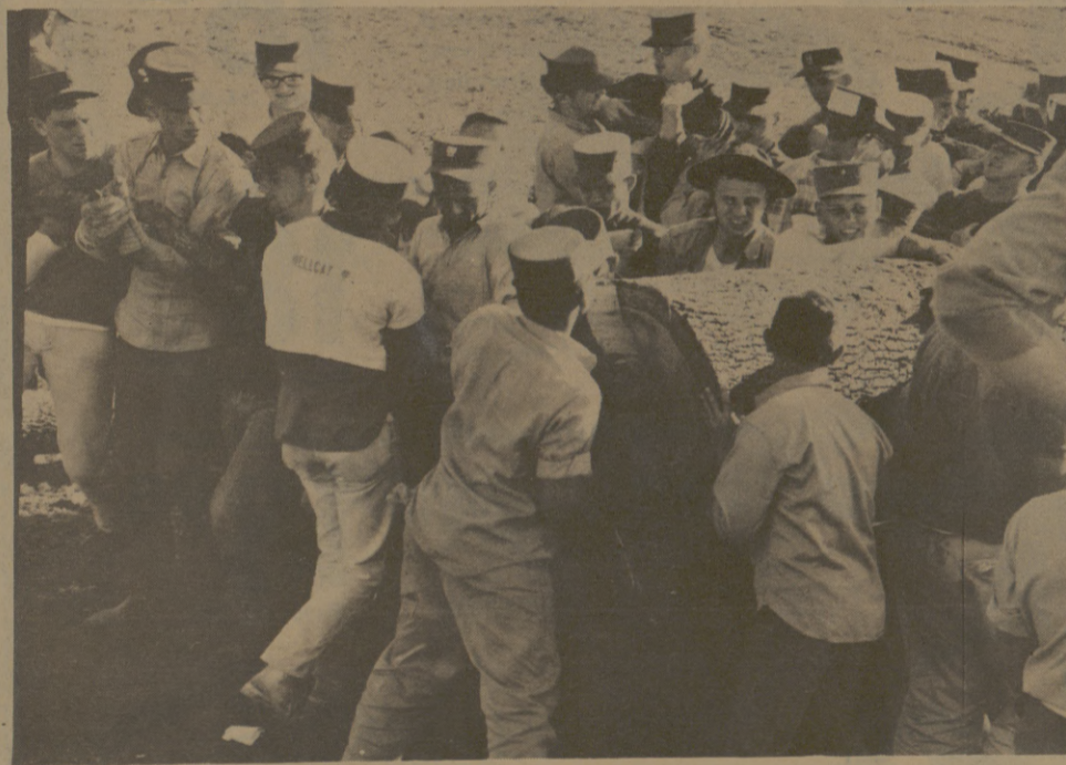
OKAY, HEAVE ... first step in moving logs from area to area.