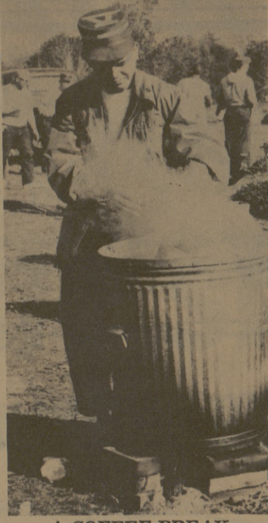
A COFFEE BREAK ... Ag dips in for hot coffee at cutting area.