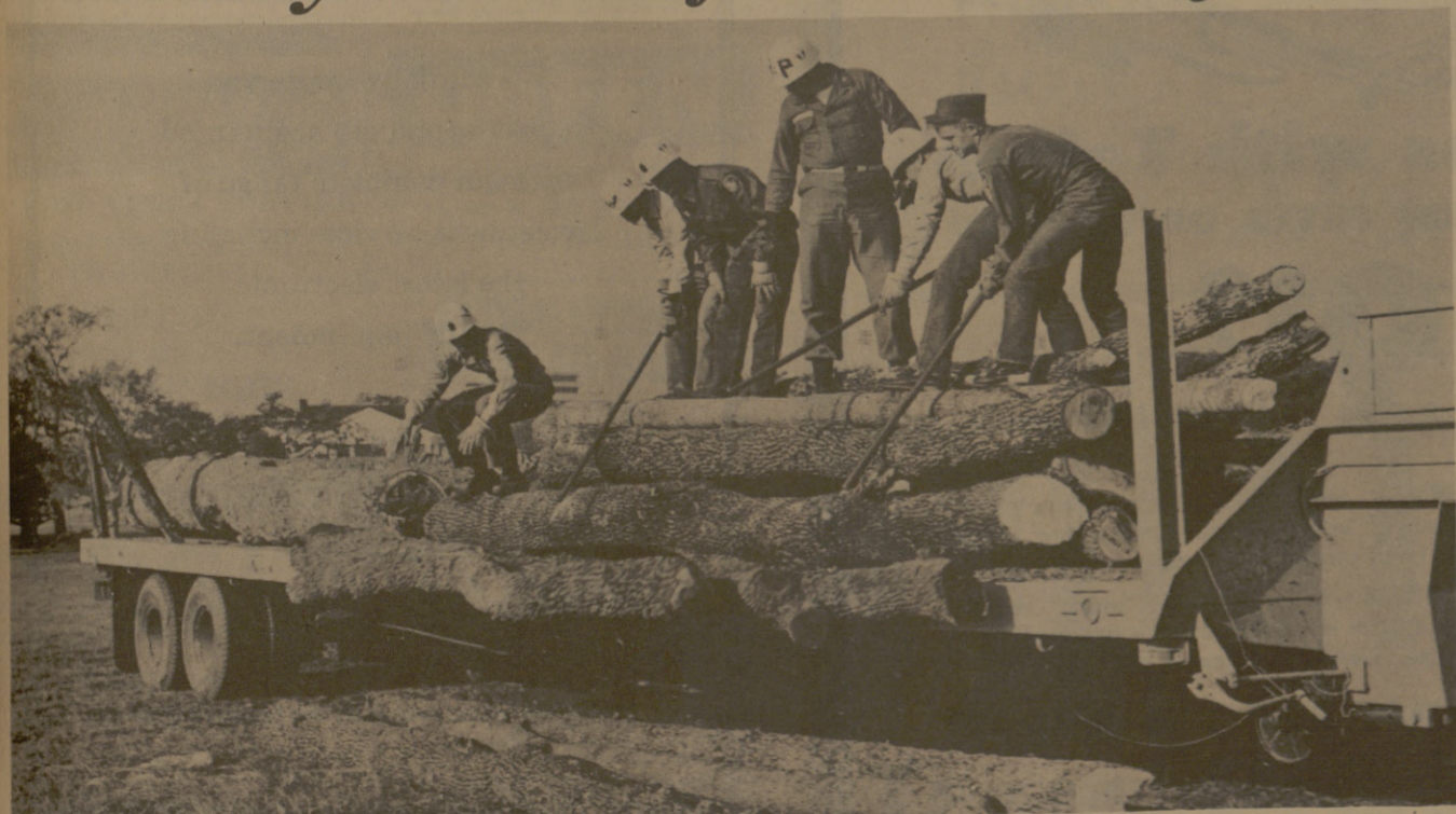
AGGIES GET READY TO LOAD LOGS ... hardest task is getting big ones on trucks to be carried to stacking area.