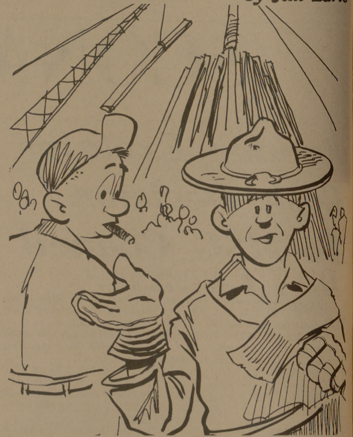
"This has been a terrible disappointment to my class! We'll never be able to live down th' fact that we built th' bonfire in good weather!"