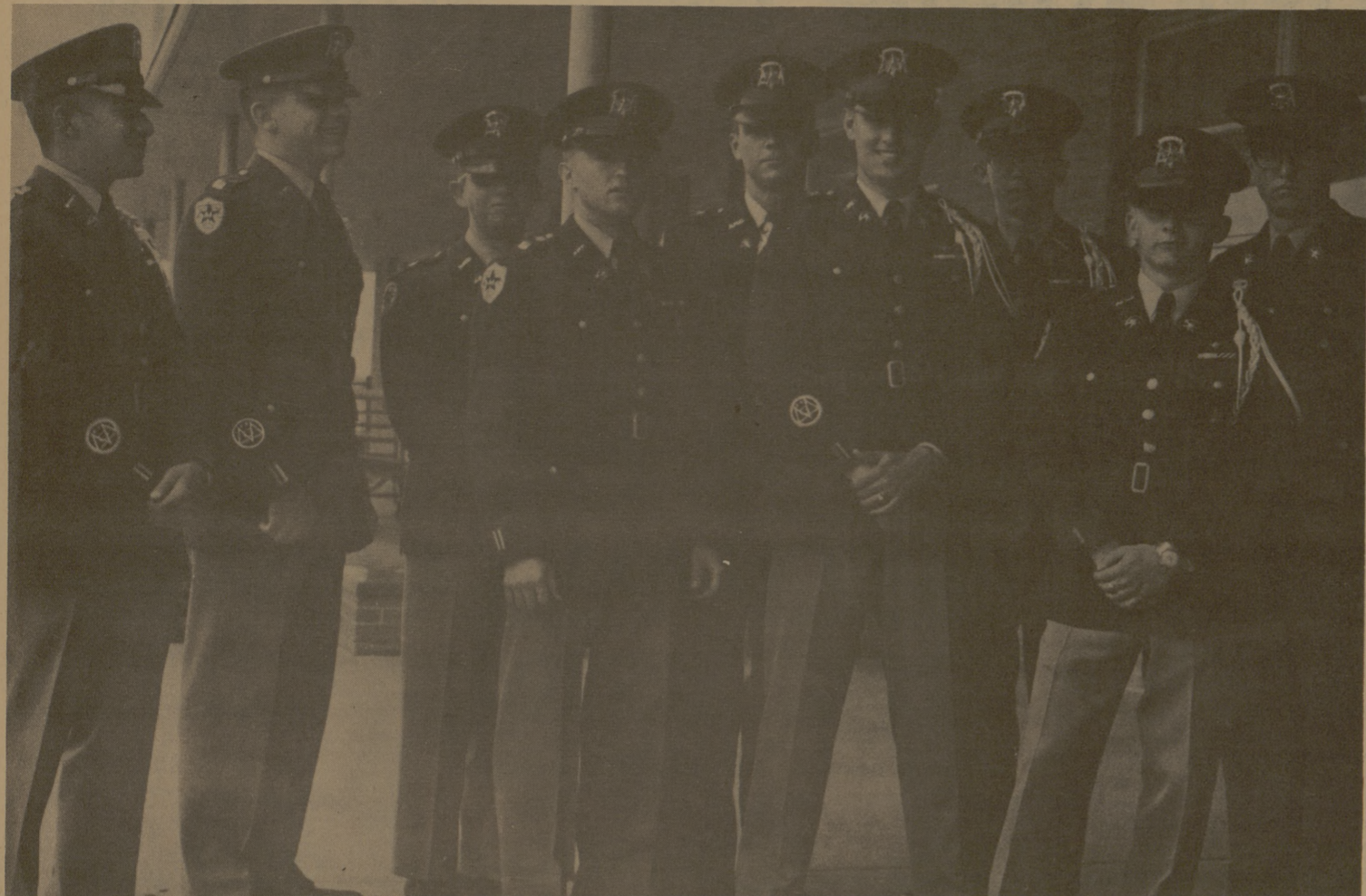
THE INVASION FORCE