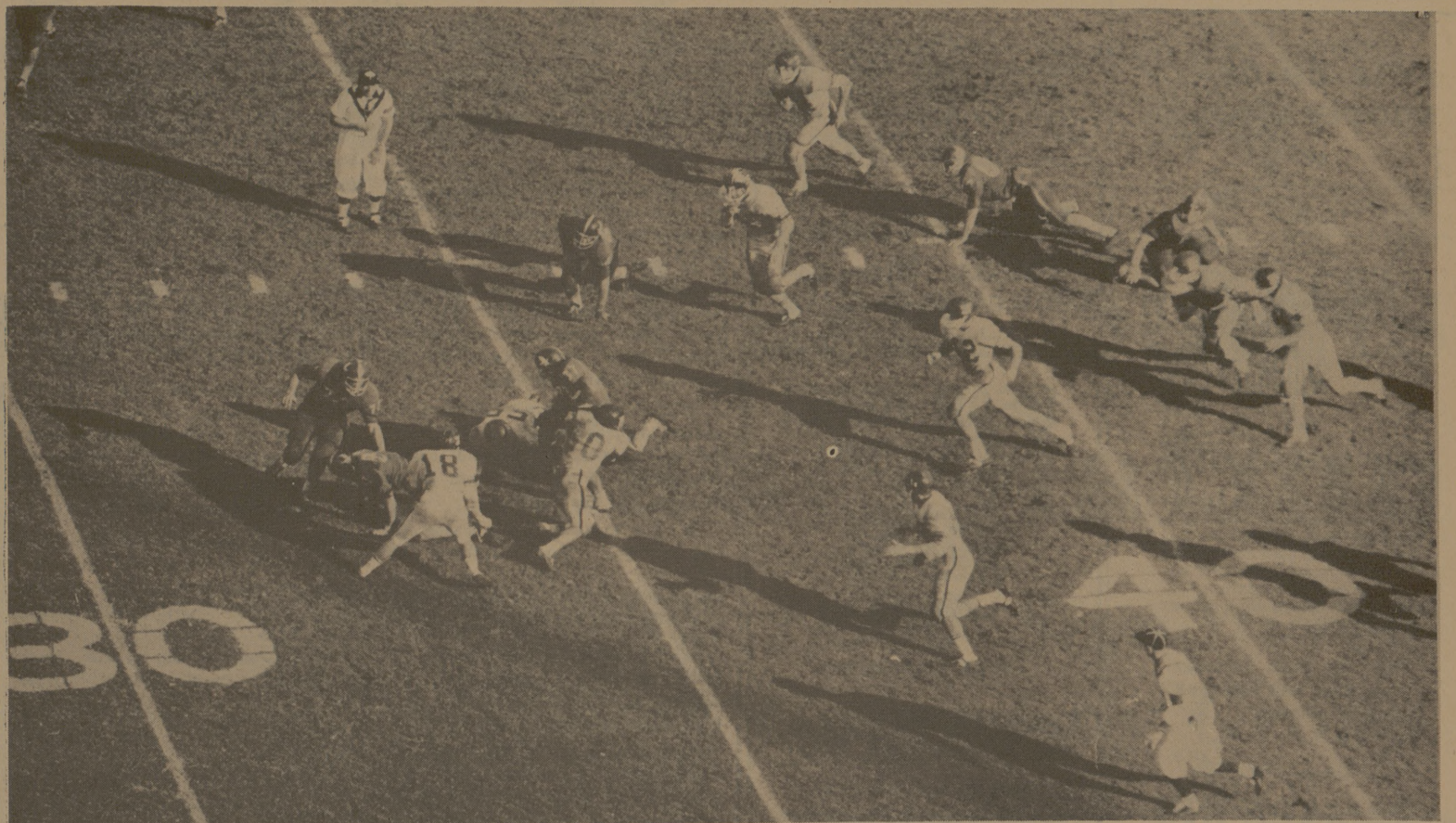
AGGIE PURSUIT - '65 STYLE