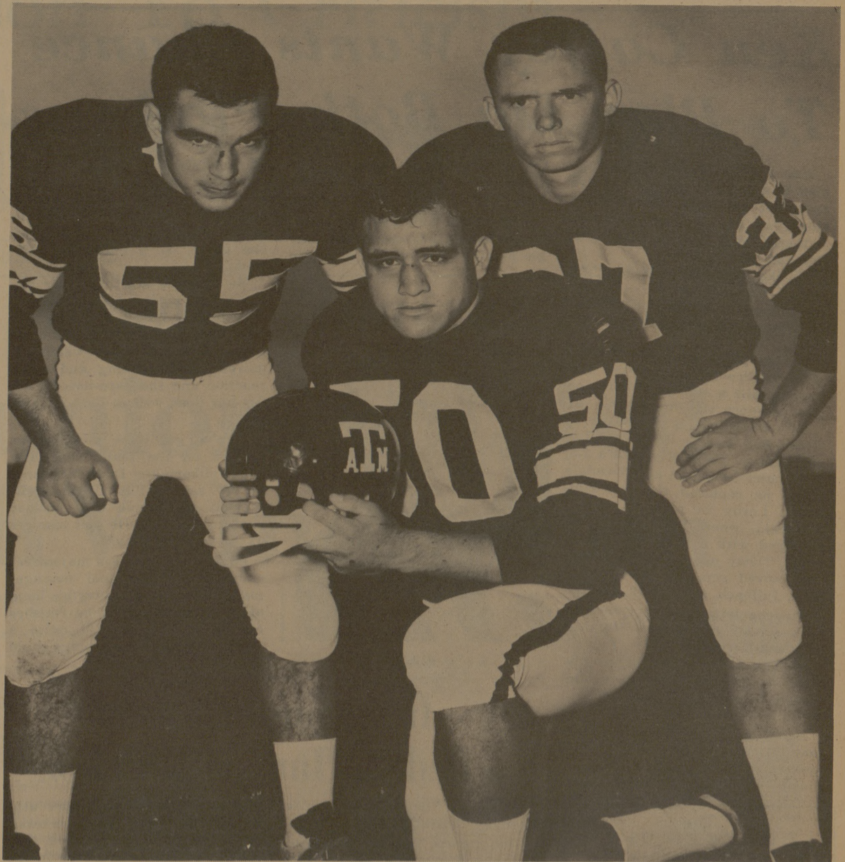
THE MIGHTY DEFENSIVE TRIO