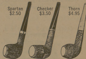
Official Pipes New York World's Fair

No matter what you smoke you'll like Yello-Bole. The new formula, honey lining insures Instant Mildness; protects the imported briar bowl—so completely, it's guaranteed against burn out for life. Why not change your smoking habits the easy way—the Yello-Bole way. $2.50 to $6.95.