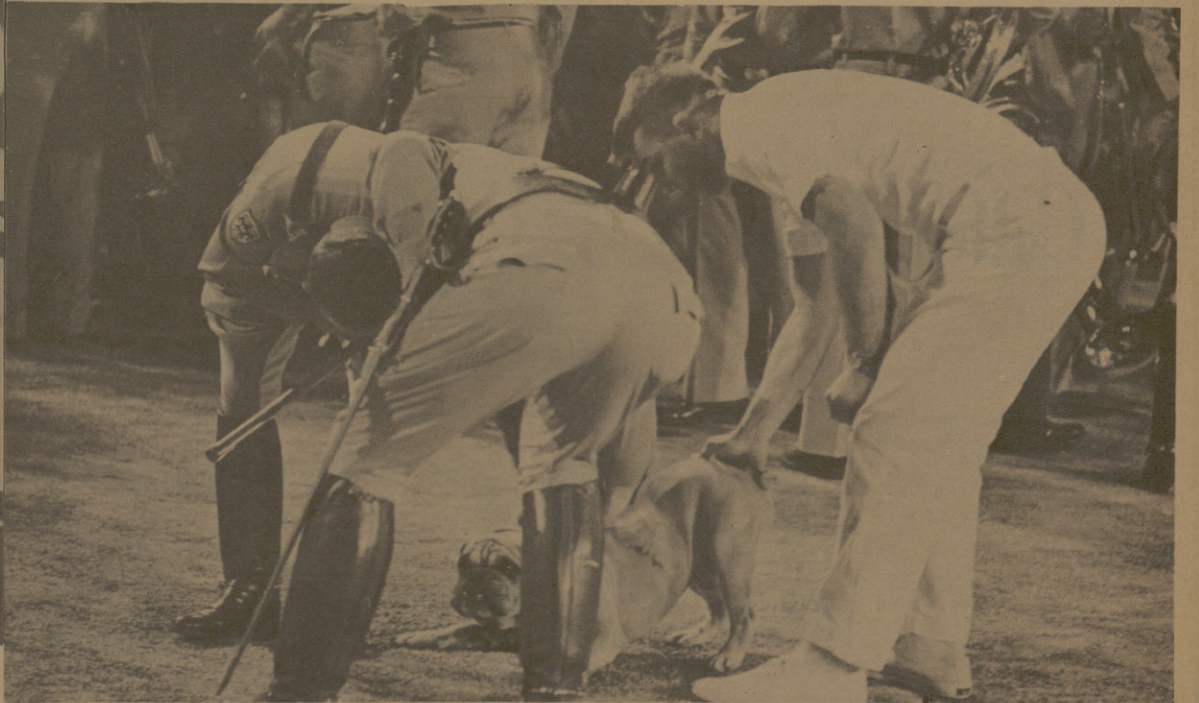
THERE AIN'T NO CARS TO CHASE