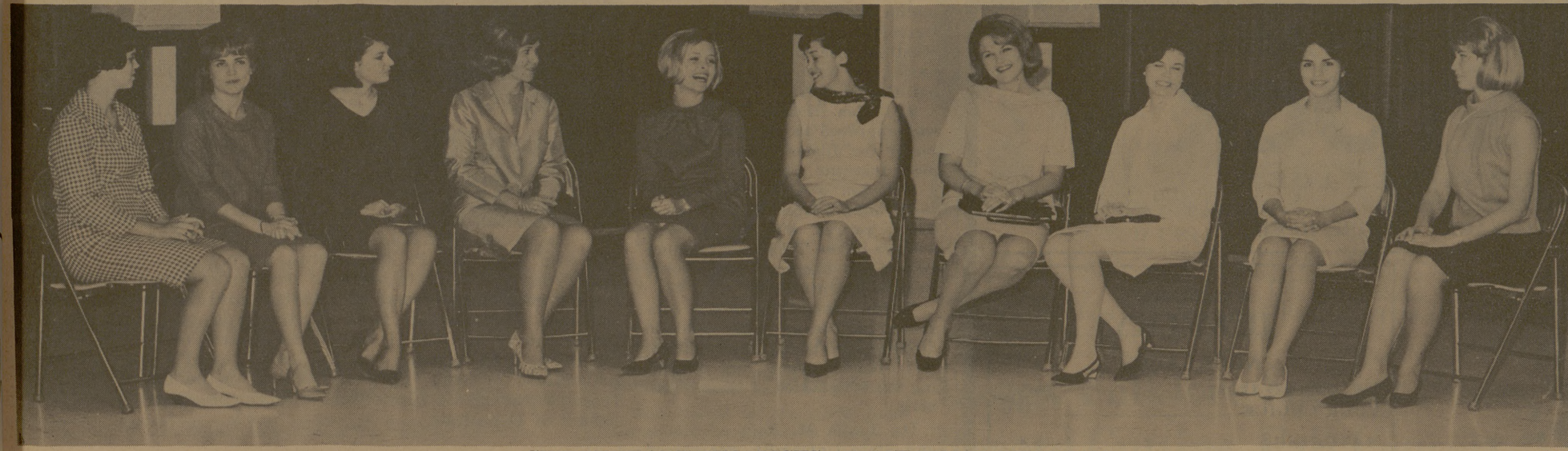
SWEETHEART FINALISTS AWAIT FINAL DECISION