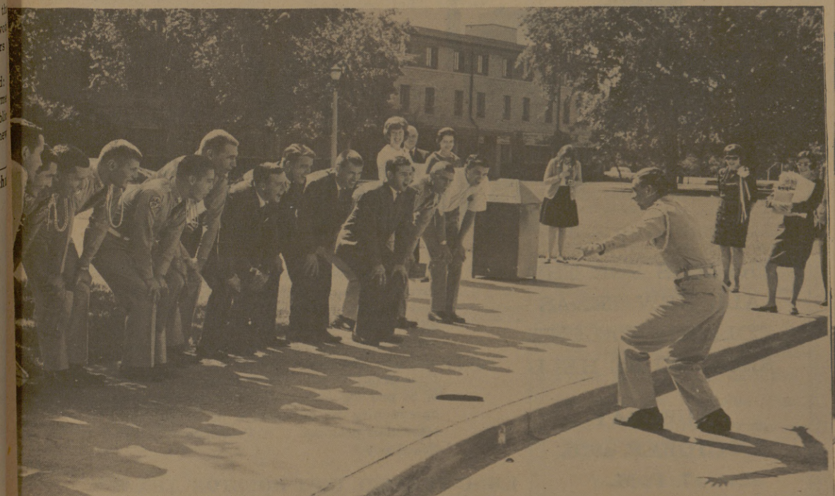
ESCORTS SPELL IT OUT FOR TESSIES

Yell leaders, front row, and their dates lead followed closely by the Aggie Sweetheart finalists and their escorts.