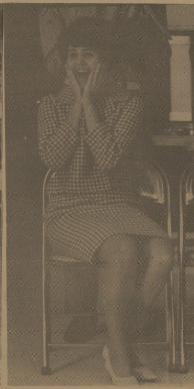
I CAN'T BELIEVE IT!

Freshmen are shown—and upperclassment practice—what Aggies do after scoring during a game. The demonstration was given during Midnight Yell Practice.