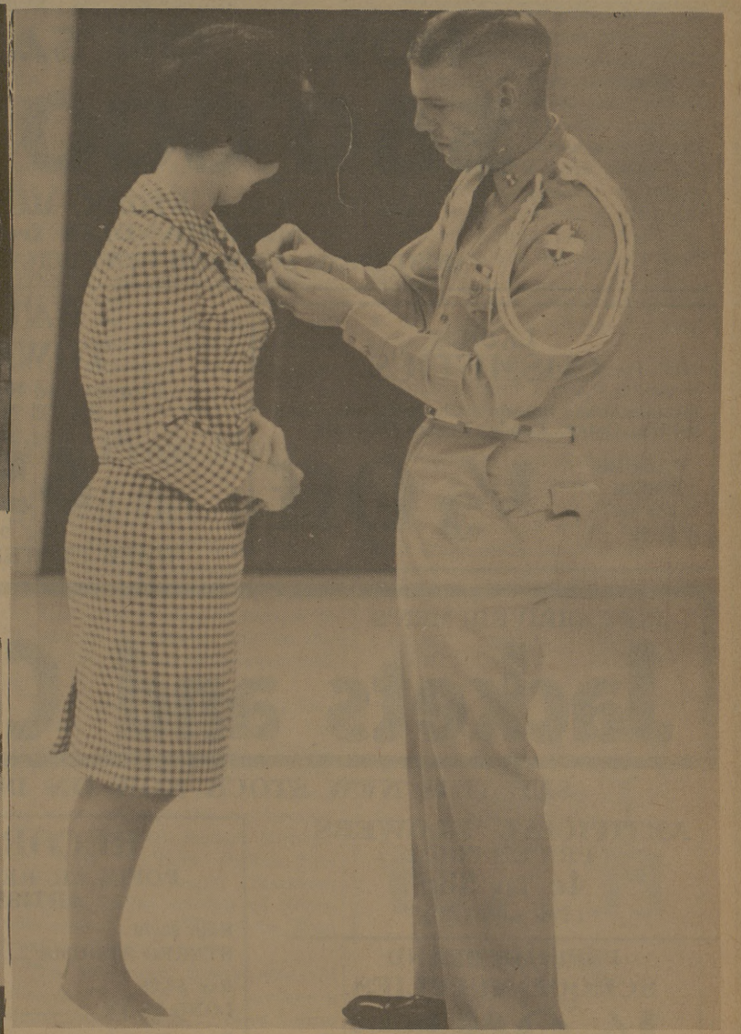
NOW PINNED TO 9,000 AGGIES