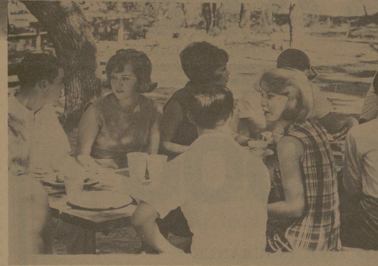
GETTING TO KNOW YOU

Brothers Four at Town Hall Friday night. About 7,700 Another weekend attraction was the appearance of the persons jammed G. Rollie White Coliseum for the two-hour performance.