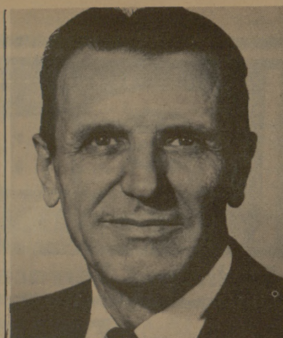
B. M. HACKNEY

FREE 100 S & H Green Stamps With This Coupon and The Purchase of $10.00 or More (Limit One Per Customer) Must Be One Purchase. (Cigarettes Excluded) ORR'S Super Market Void After Oct. 2, 1965.