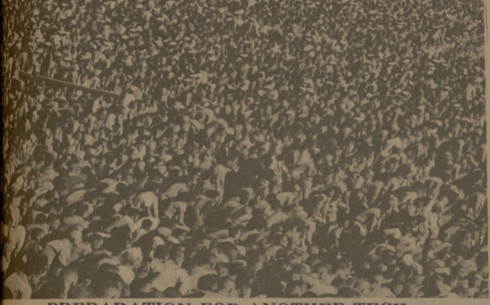
PREPARATION FOR ANOTHER TECH

port Saturday night after the Aggies returned from downing Georgia Tech 14-10.