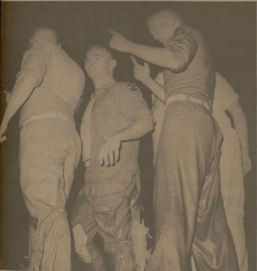
ONE IS MISSING

Company B-2 keeps the spirit up for the Texas Tech game by displaying the first dorm sign. The Aggies play Tech Saturday in Lubbock for the first conference game.