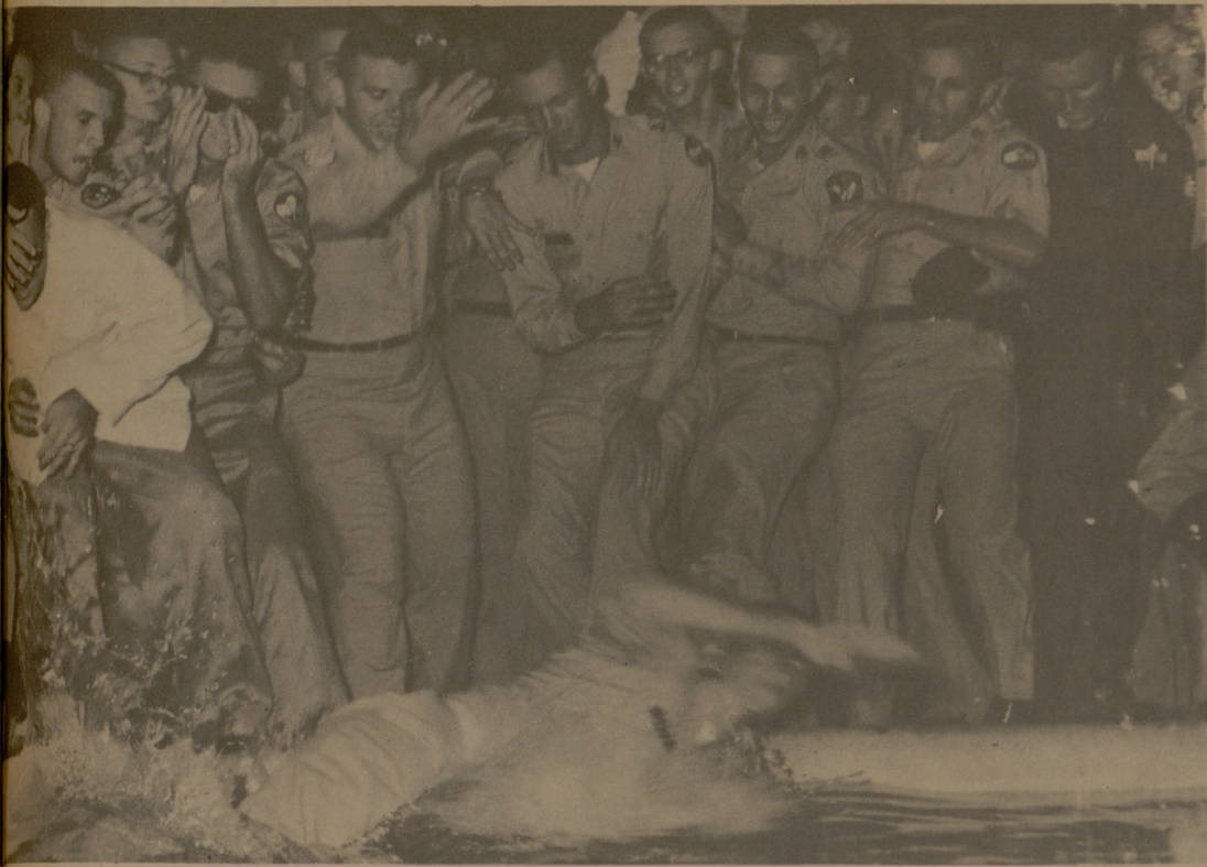
A VICTORY SIGN

Even though yell leaders are not suppose to be dunked in the Fish Pond after an out-of-town win, Aggie fish took advantage of the Georgia Tech victory and dumped yell