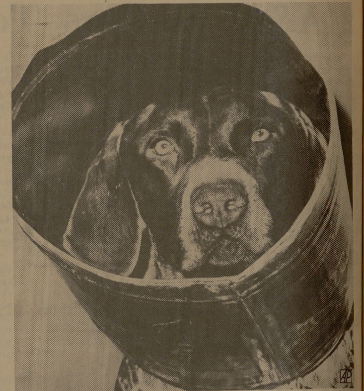
DOG WITH A CAN-ON

An addition to the dining room will soon be completed.