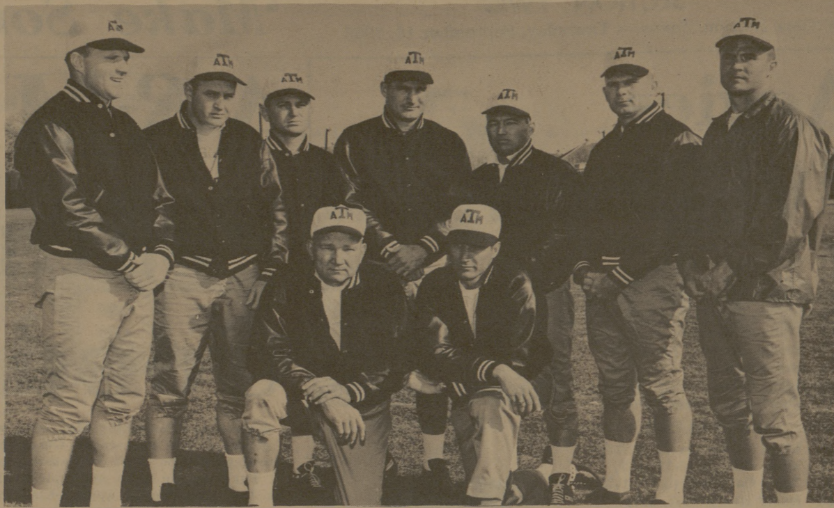
NEW AGGIE GRID STAFF

SUM UP —The Aggies will play on guts, gumption and gung-ho spirit because they won't out-personnel any of their foes.