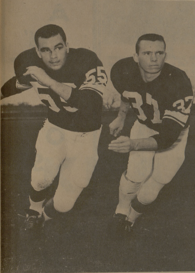
TOP CADET TACKLERS

tions," replies Stallings, "I've been away from the SWC too long and I don't know my enemies well enough. We intend to go out there and 'Make Something Happen,' and I don't think anyone is going to embarrass us too much."