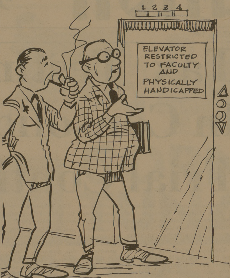
"I can't put my finger on it, but this sign has always bothered me!"