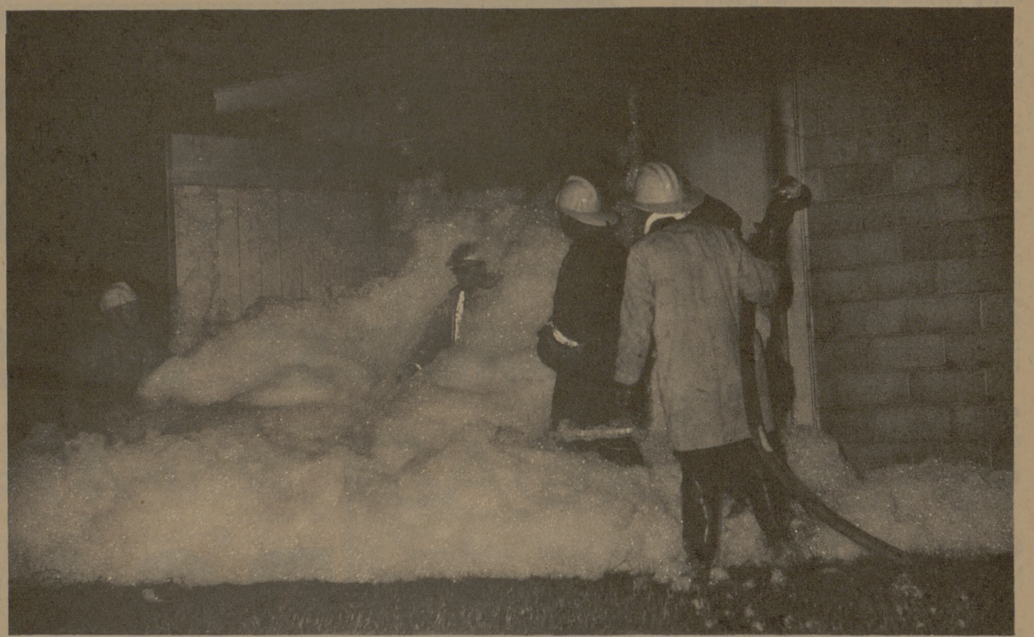
FOAM FIRE EXTINGUISHER

The school began July 25 and will last until August 6. Over 2,000 firemen are expected to participate.