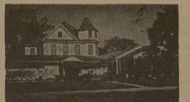
Hillier Funeral Home

BRYAN, TEXAS 502 West 26th St. PHONE TA 2-1572