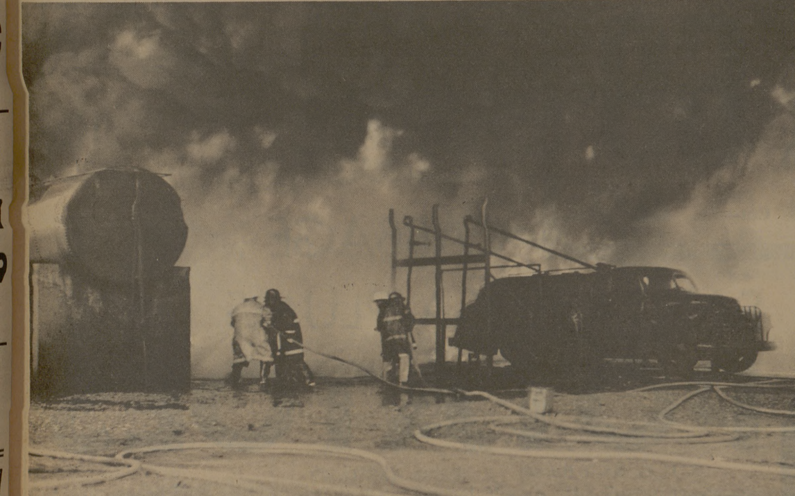
FUEL STORAGE BLAZE

An aerial ladder is used to lower a victim down in smooth compared to conventional methods. This method is quick and safe, in that the ride