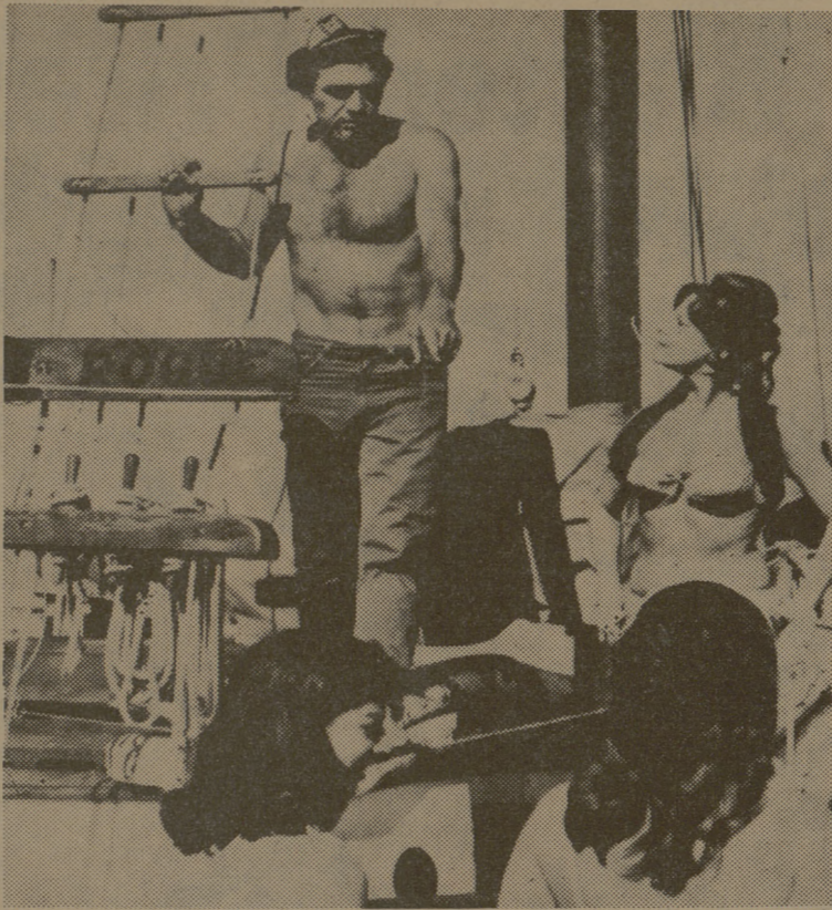
DECEASED SCREEN STAR Actor Steve Cochran, identified in Guatemala as the man found dead aboard the schooner Rouge of Guatemala, is shown in one of the last pictures made of him alive. He was photographed aboard the Rouge off the California coast last November with three young actresses.