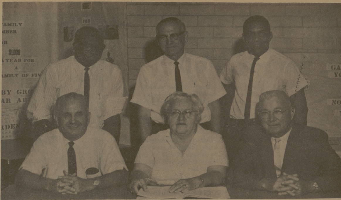
EXTENSION WORKER SCHOOL INSTRUCTORS

A&M currently admitted girls to its regular sessions on a day student basis in 1963. Undergraduate female enrollment is limited to wives and daughters of faculty, staff and students.