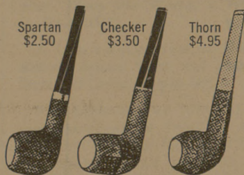
Spartan $2.50 Checker $3.50 Thorn $4.95

No matter what you smoke you'll like Yello-Bole. The new formula, honey lining insures Instant Mildness; protects the imported briar bowl—so completely, it's guaranteed against burn out for life. Why not change your smoking habits the easy way—the Yello-Bole way. $2.50 to $6.95.