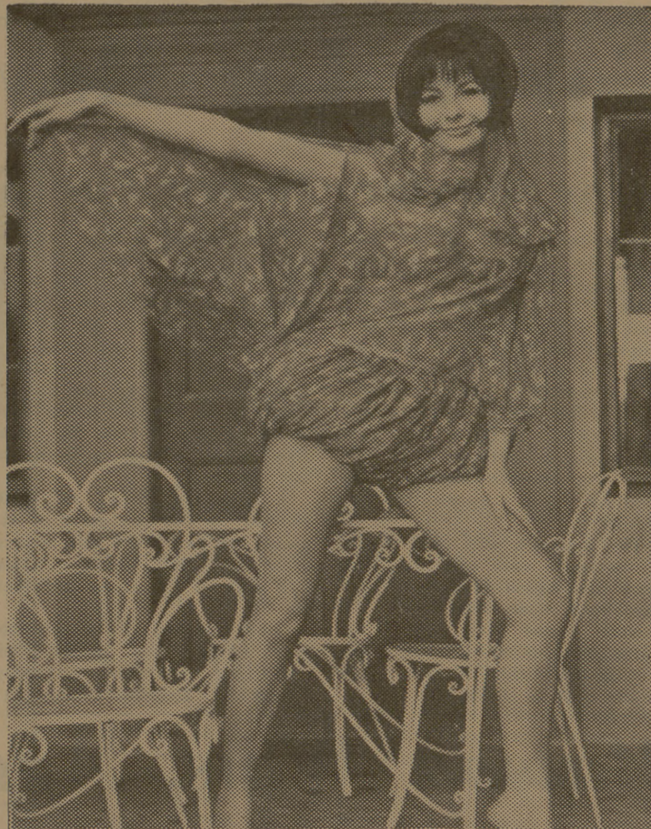
Veiled Bikini From Italy