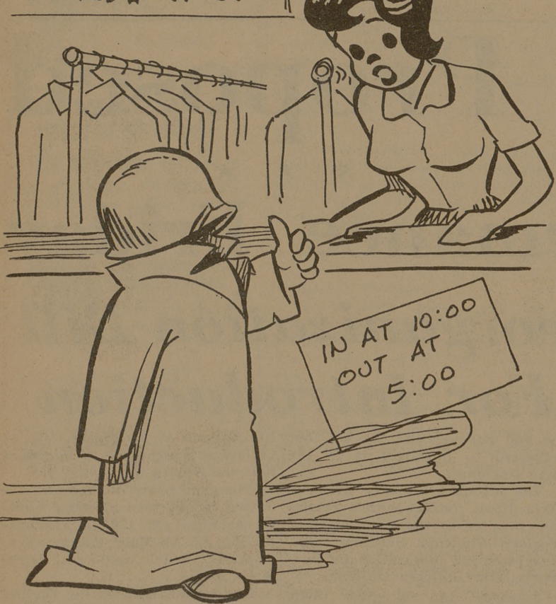
"What kind of a cleanin' job is this—you took all th' wrinkles out!"