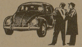
Guess the age of this Volkswagen.

We're having open house Saturday, 8 a.m. to 6 p.m. Please come. (After all, it's not often we can show you something that's new and big.)