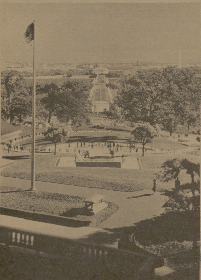
LOOKING TOWARD WASHINGTON . . . grave faces Lincoln Memorial across Potomac Bridge.