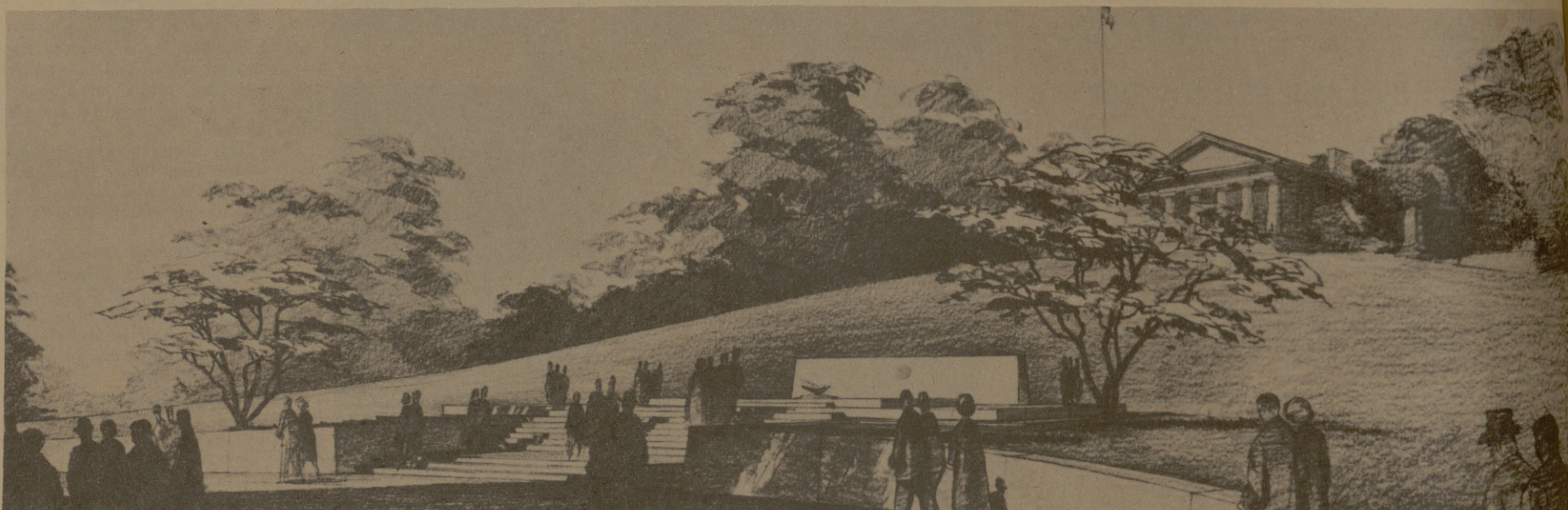
GRAVE WITH CUSTIS—LEE MANSION IN BACKGROUND . . . eternal flame surrounded by low wall with Presidential seal.