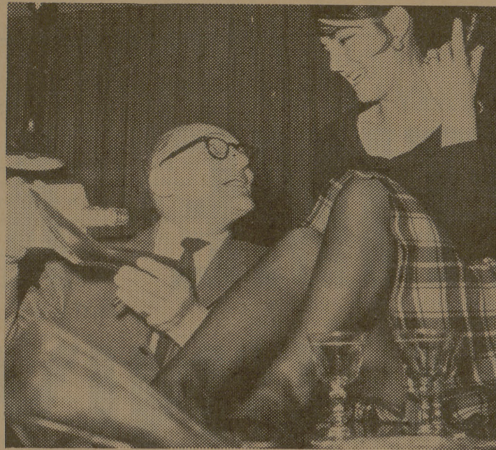
Never Too Big