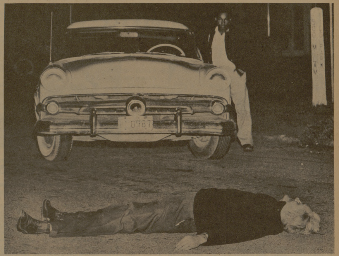
Pedestrian Safety Necessary, Too More pedestrians are killed during the most dangerous period for pedestrians is Christmas-New Year's holiday season than from 6 p. m. to midnight on Christmas Eve. during any other time of the year. The

More than 25,000 miles without an accident is a record to be proud of.