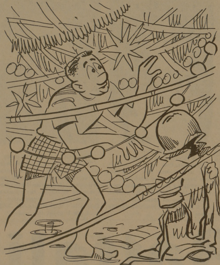
"You've sure done a good job decoratin' th' room Fish Squirt! Could you show me where my bed is?"