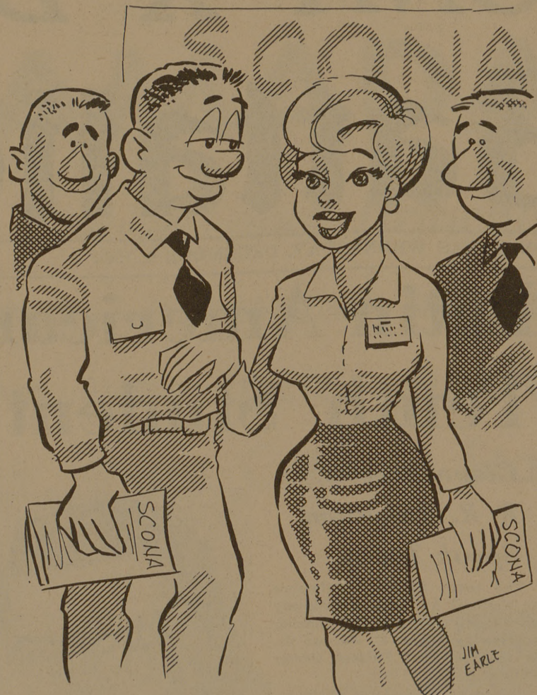
"I had no idea that there was so much interest in national affairs at A&M!"