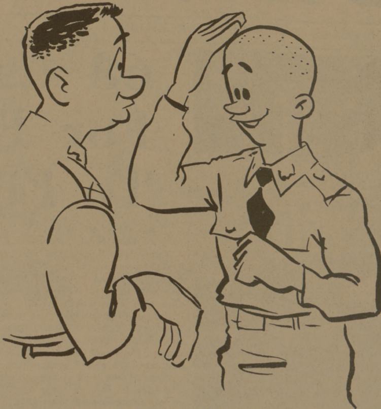
"I'm hazing our upperclassmen! A bull sees my haircut, asks what outfit I'm in, and then jumps th' upperclassmen! We've got'em really scared!"