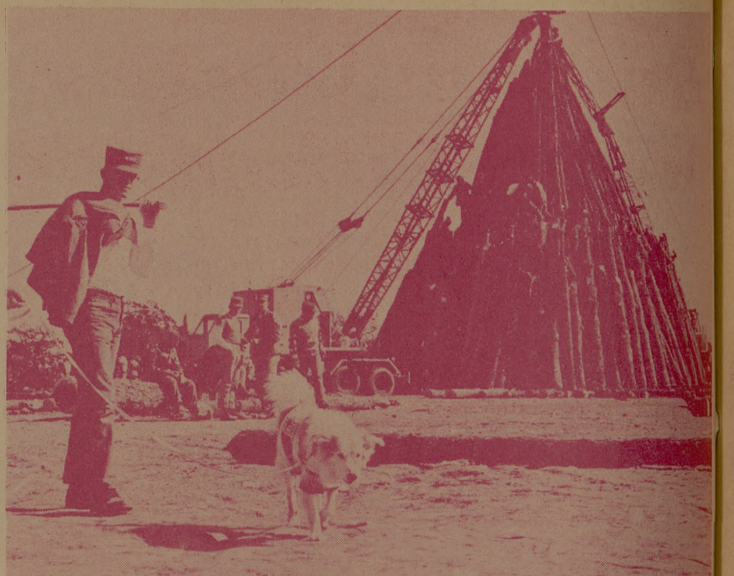
HONORED GUEST INSPECTS WORK ... Reveille will be present when torch is put to the Bonfire.

he roughly ordered the dog off her seat. Rev had won again. Sneaking onto Kyle Field during half-time at the first football game that year Rev won the hearts of the Aggies as well as those of the spectators when she romped to the music of the Aggie Band. Later that same year the Corps decided to further immortalize their mascot. Rank in the armed services could be purchased for a dog, ranging in price from $1 for private to $100 for a general's commission. Raised and educated at the world's largest military school, Rev was definitely qualified to be a general. In a short time, Reveille became a four-star "ladygeneral" in the K-9 Corps, with a collar showing her rank. When Reveille I died on Jan. 18, 1944, a complete military funeral was held in the middle of Kyle field. Her remains were buried at the main entrance to the stadium "so that she might