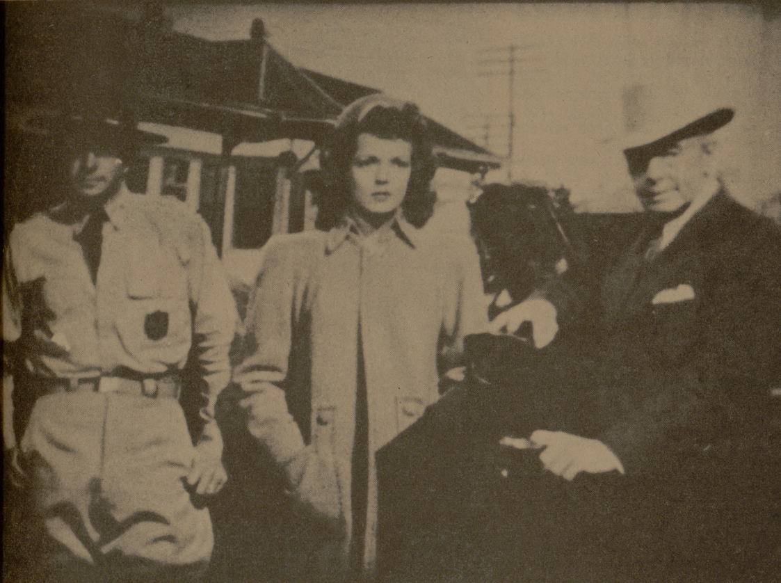
TRAINS ONCE STOPPED ... at least for the star of "We've Never Been Licked."