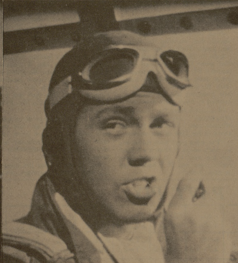
ONCE AN AGGIE ... always an Aggie.