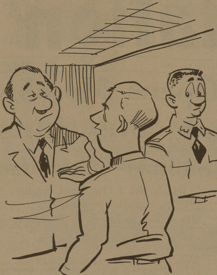
"... So this doctor I saw in Dallas last weekend suggested I see this specialist in Houston this weekend, so 'bout that Friday class..."