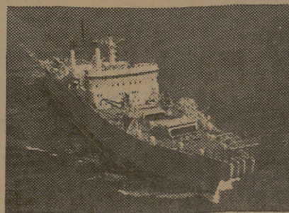
and under the sea ...