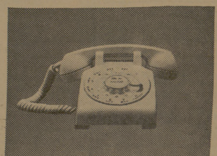
to provide the world's finest communications