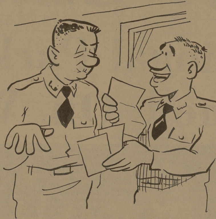
"They didn't send a photo of your date but it says here that she has th' best personality of th' bunch!"