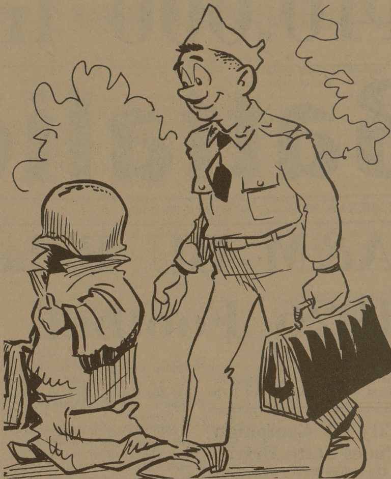
"Only 3 more games after Baylor and we get a shot at Texas!"