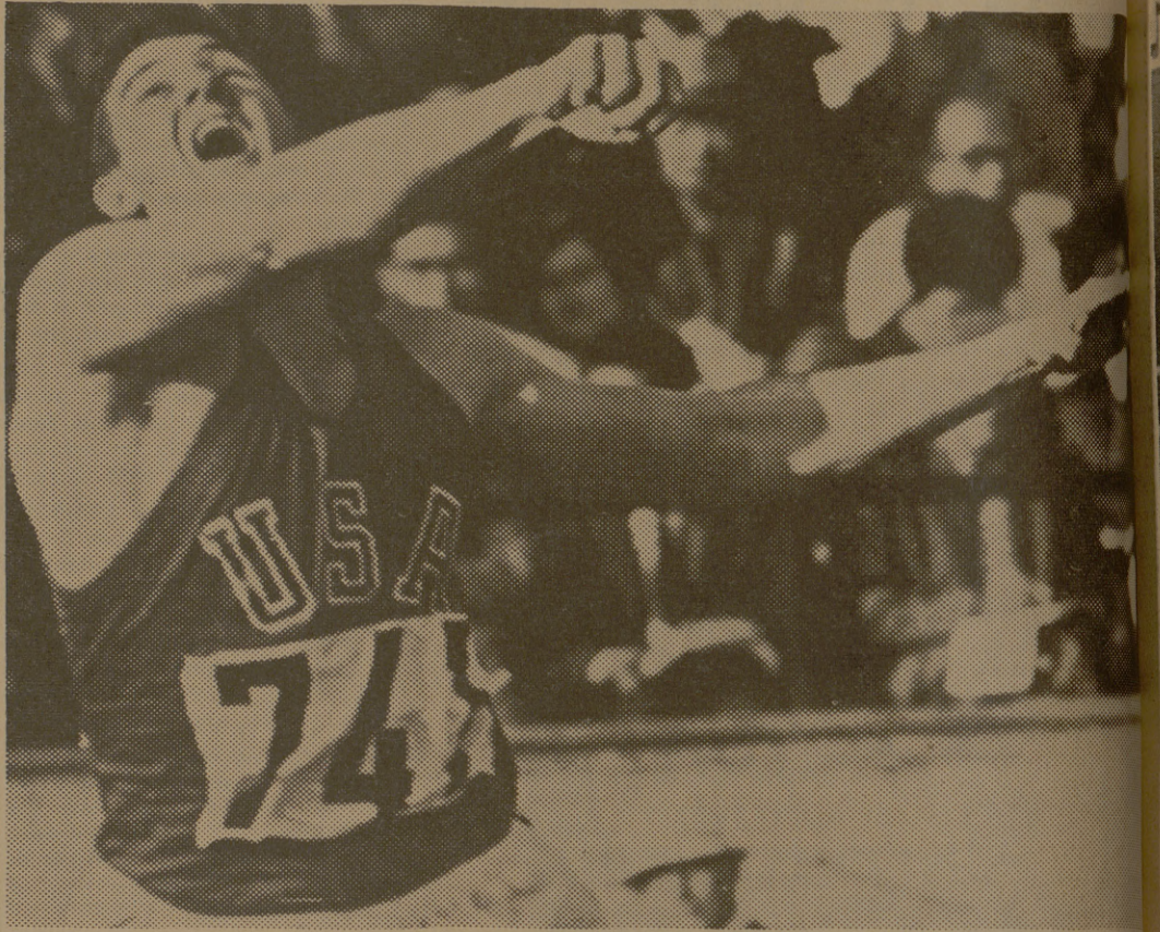
Aggie Sophomore Hits 66'3/4" Randy Matson is shown in action in the mate Dallas Long by five inches. (AP) Olympic shot put in Tokyo. The Cadet photo) weightman placed second to U. S. team-